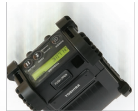
Robust and rugged, withstands a 1.8m drop on to concrete (1.5m for B-EP4)