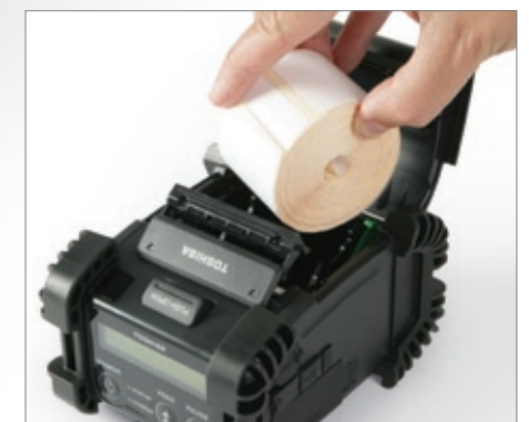
Market-leading media capacity for fewer roll changes