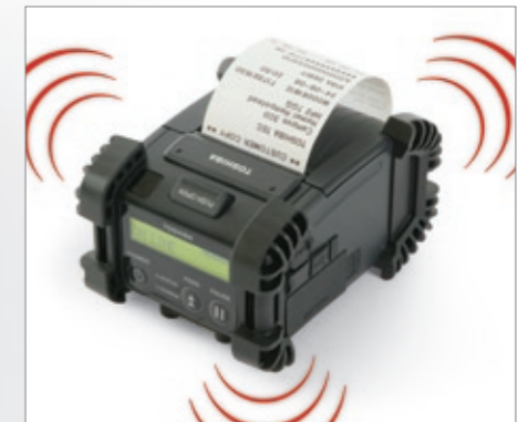
Wi-Fi certified (GH40 model)